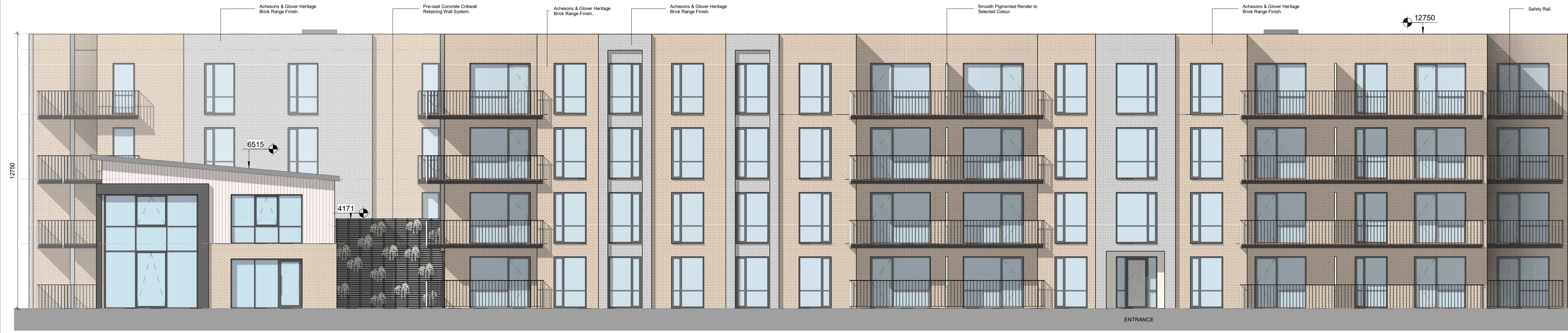
1 South Elevation

NOTES: * For more information regarding required areas please refer to housing Quality Assessment