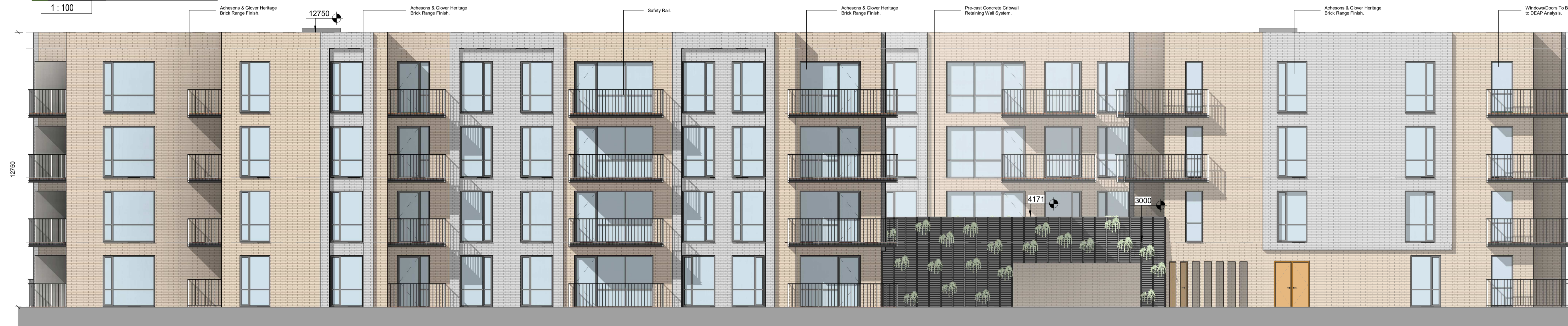
2 East Elevation